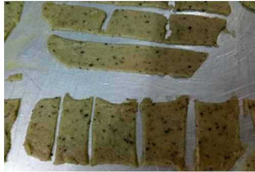
Sea cucumber chips