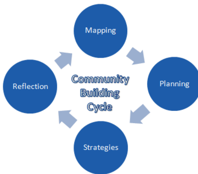
Fig. 2 Community Building Cycle