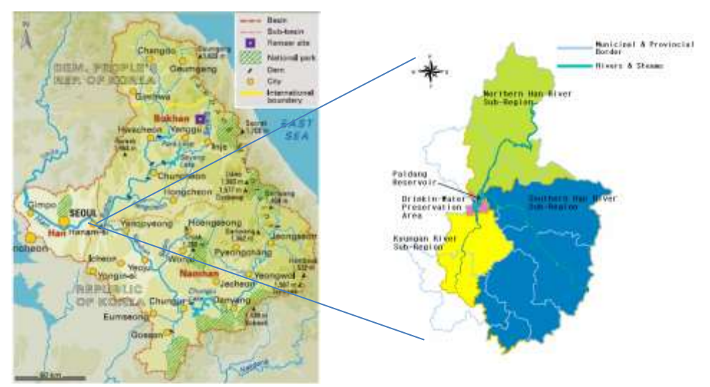
Fig. 1: Map of Paldang Reservoir (modified from [20])

is well known that these non-point-source pollutions can accelerate algae bloom when it comes with high temperature.