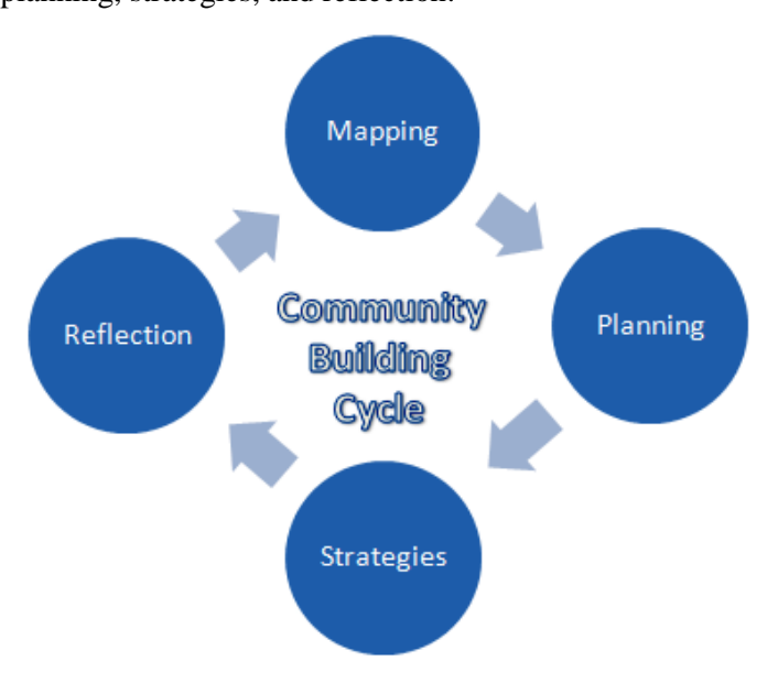
Fig. 2 Community Building Cycle