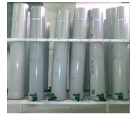
Fig. 1: Polyethylene columns filled with the soil.

This study was conducted in Yasouj University in 2014. Polyethylene columns (80 cm in length and 8 cm in diameter) filled with a clay loam soil (Fig.1). Table I presents general characteristics of the studied soil. A completely randomized design was used. Enriched municipal wastewater with Pb (40 mgl<sup>-1</sup>) and Cd (20 mgl<sup>-1</sup>) was added to soil columns during 8 periods of 10 days followed by the measurement of chemical properties of drainage water in each stage. After the final stage soil samples were taken from the depths of 0-20 and 40-60 cm of soil columns and were analyzed. Experimental treatments consisted of 3 levels of vermicompost comprising control (V1), 2% (V2) and 4% wt (V3) and time in 8 levels with 3 replications.